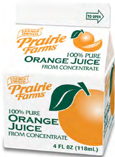
100% Pure Orange Juice From Concentrate 4oz Carton, Item #1977

Healthy drink choices during the school day gives kids lasting nutrition to fuel growing bodies.