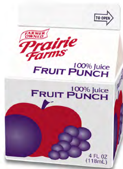
100% Juice Fruit Punch 4oz Carton, Item #25632

*Percent Daily Values are based on a 2000 calorie diet INGREDIENTS: WATER AND APPLE JUICE CONCENTRATE, ASCORBIC ACID (VITAMIN C).