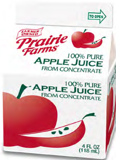
100% Pure Apple Juice From Concentrate 4oz Carton, Item #8508

*Percent Daily Values are based on a 2000 calorie diet INGREDIENTS: FILTERED WATER, ORANGE JUICE CONCENTRATE. CONTAINS JUICES FROM FLORIDA, BRAZIL, MEXICO, AND COSTA RICA.